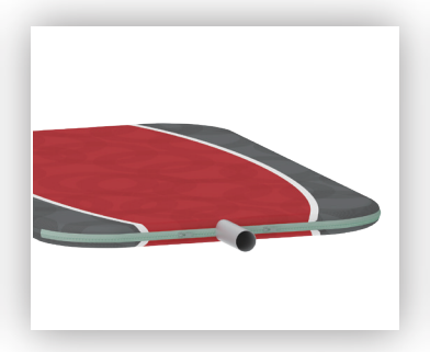
6. Zip the fabric as far as it will go.