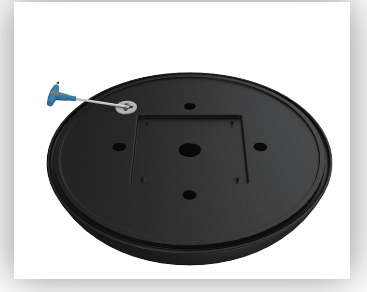
2. Tightly screw in the plastic washer to prevent leaking.