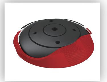
3. Assemble the fabric on the base by feeding the silicone edge into the grooves.