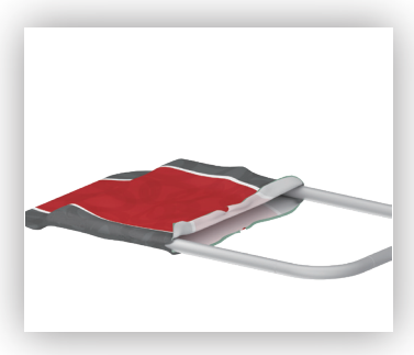
5. Slide fabric into the aluminum frame.