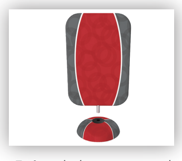
7. Attach the poster stand to the Bubble base.