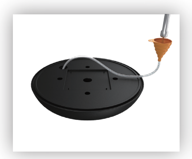
1. Use provided funnel to add water to the base.